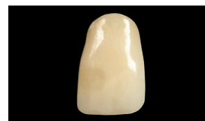
Gaenial Anterior (GC)