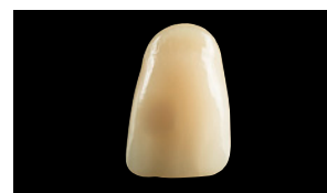
Z100 (3M Espe)