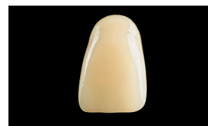
Charisma – New

The secret behind the intensely natural look: Charisma's ideal shade match makes single-shade layering techniques even more easy and convenient