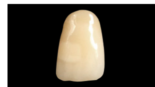
Amelogen Plus (Ultradent)