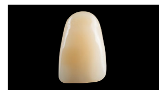
Herculite XRV Ultra (Kerr)