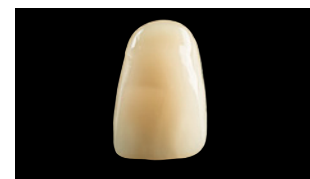
Charisma – Old