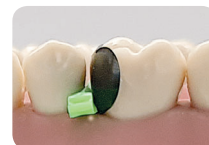
LumiContrast - sectional matrix indicated in case of standard interproximal spaces and cavities