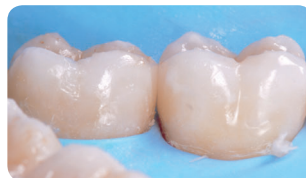
Side view of the restoration before finishing and polishing showing the accurate morphological reconstruction afforded by QuickmatFIT matrices

Choosing a matrix able to mimic or reproduce the original morphology of the tooth and its curvatures is the first step towards a successful aesthetic and functional restoration.