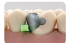
QuickmatFIT - anatomical sectional matrix indicated in case of wide interproximal spaces and large cavities

QuickmatFIT are anatomically enhanced stainless steel sectional matrices with 0.04 mm thickness available in three anatomical shapes to cover all types of Class II posterior restorations. QuickmatFIT matrices are especially indicated for wide interproximal spaces and large cavities. Easy to handle thanks to their placement tabs, QuickmatFIT matrices feature a rolled occlusal edge for easy marginal ridge restoration.